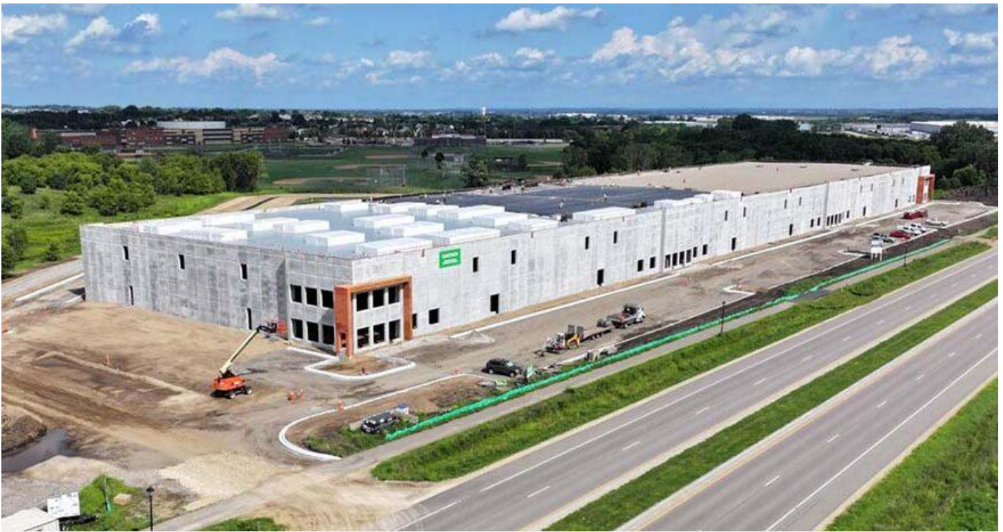
This August 2025 photo shows the Lakeville 35 Logistic Center North Addition under construction in Lakeville. Likewise Partners is the developer.